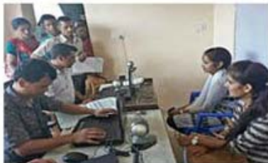
National ID Registration

TPS450 is suitable for various scenarios, owing to its full and stable functions. For examples, it can be used in the mobile id information collection, ingress protection, school attendance, biometric identification, transportation, ballot, etc.